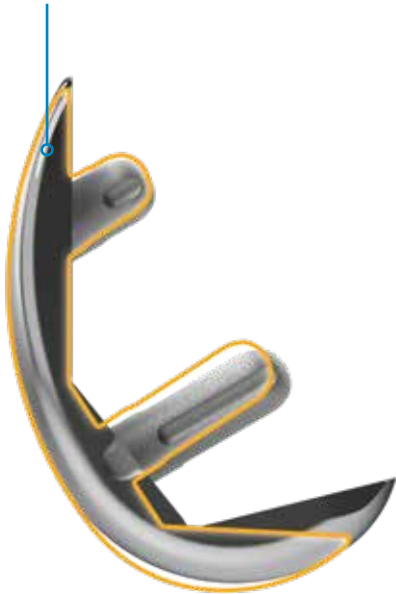
Yellow outline indicates the Zimmer M/G Uni