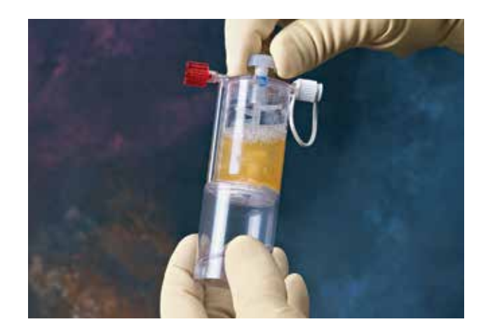
Figure 10 Figure 12