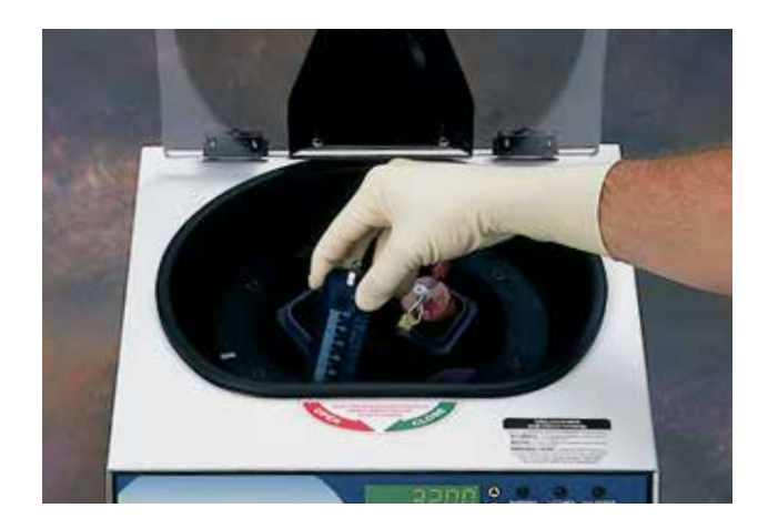
Figure 1 Figure 3