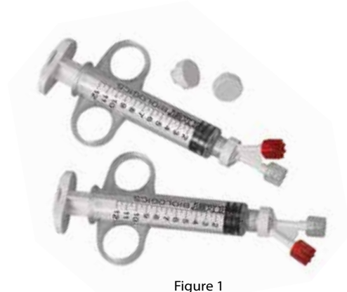
Figure 1 Contents of CoAxial Spray Kit (800-0270)