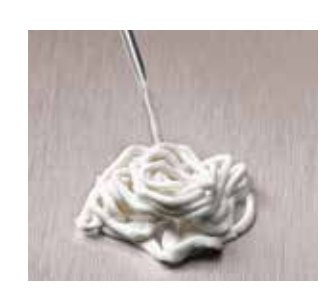
Be sure to mix thoroughly. For complete mixing instructions, refer to the instructions for use.